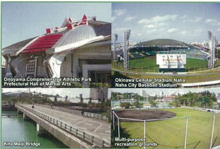
Onoyama Comprehensive Athletic Park Prefectural Hall of Martial Arts

An athletic complex with facilities for various sports including track and field. The park is also the location for the Onoyama Citizen's Festival and various other events. In addition to being known as the main site of the Naha Marathon, Onoyama Park is famous for being a comprehensive sports complex where many large-scale events are conducted. Including track and field, various sports schools are operated in the many facilities. Kita Meijibashi Bridge has become a pedestrian walk and is directly connected to Tsubogawa Station, allowing smooth access to the complex.